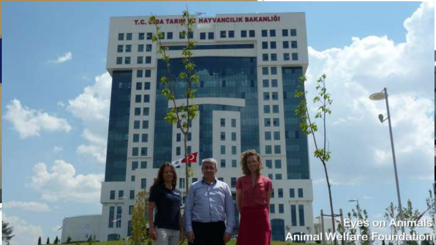
Eyes on Animals Animal Welfare Foundation