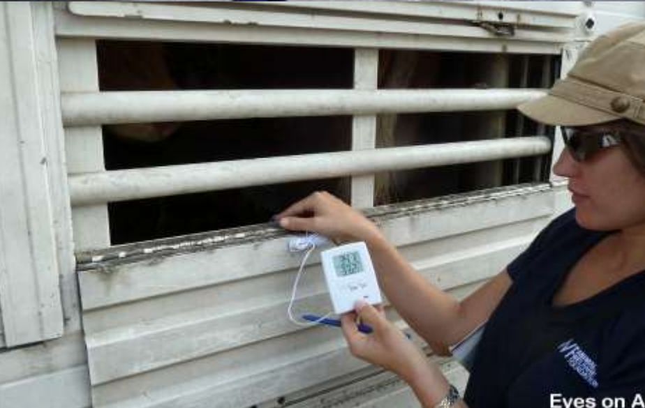
Eyes on Animals